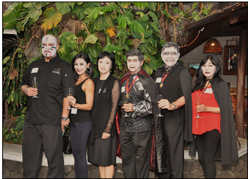
VAMPIRES! The Kahala Nui team snatched first place in the "Best Table" category of the costume contest at last year's September Spooktacular. Dress up...you and the guests at your table could be this year's winners!

A devilish "Wall of Wine & Spirits," hauntingly spectacular entertainment in the courtyard, an eerie silent auction, and a haunted